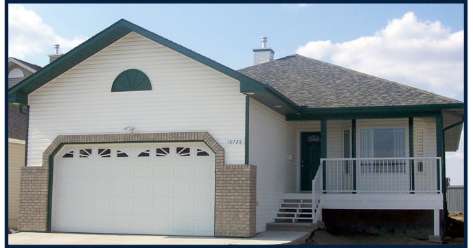
Huntington - Elevation B