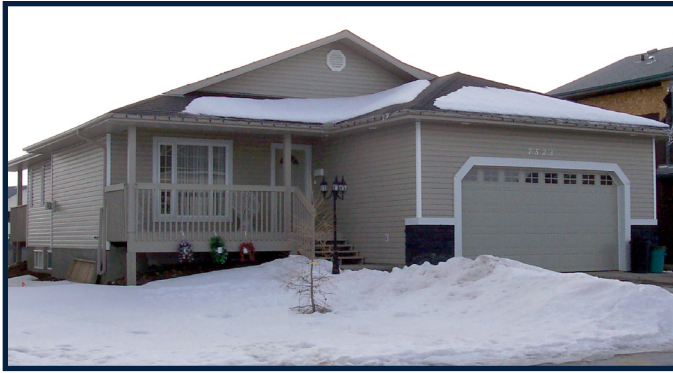
Huntington - Elevation A